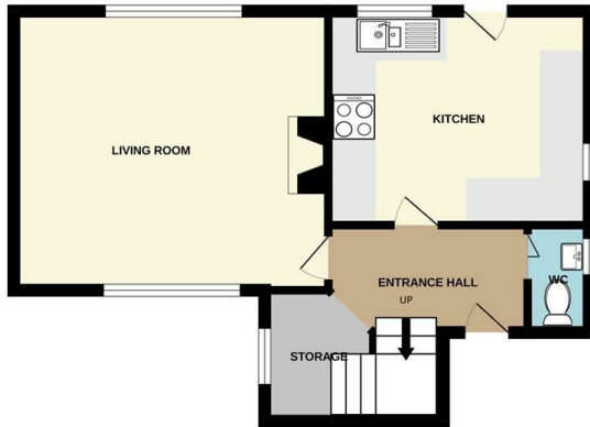
GROUND FLOOR 394 sq.ft. (36.6 sq.m.) approx.