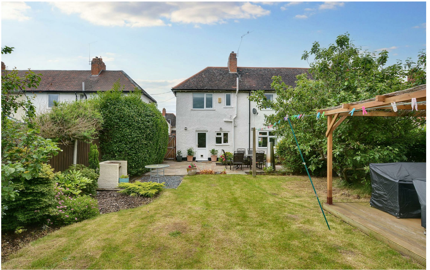
A Spacious three-bedroom semi-detached house.

Situated in this sought-after and convenient residential location, within easy reach of a variety of local shops and amenities including: schools, transport links, The University of Nottingham, and Queens Medical Centre, this fantastic property is considered an ideal opportunity for a range of potential purchasers including: first time buyers, young professionals, families, and investors.